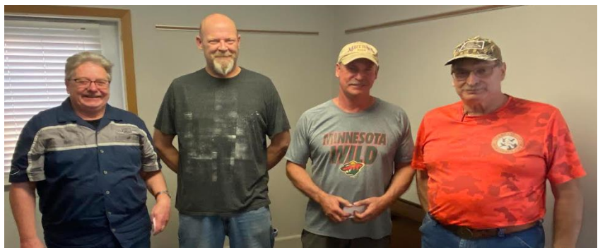
Members of the month

Thanks to the cooks and serving staff who prepared the delicious meals for both events. It takes a lot of help to put on these events and it is you that make them successful. Thanks to all the SSC and family members who also helped with the raffles, games, and clean up.